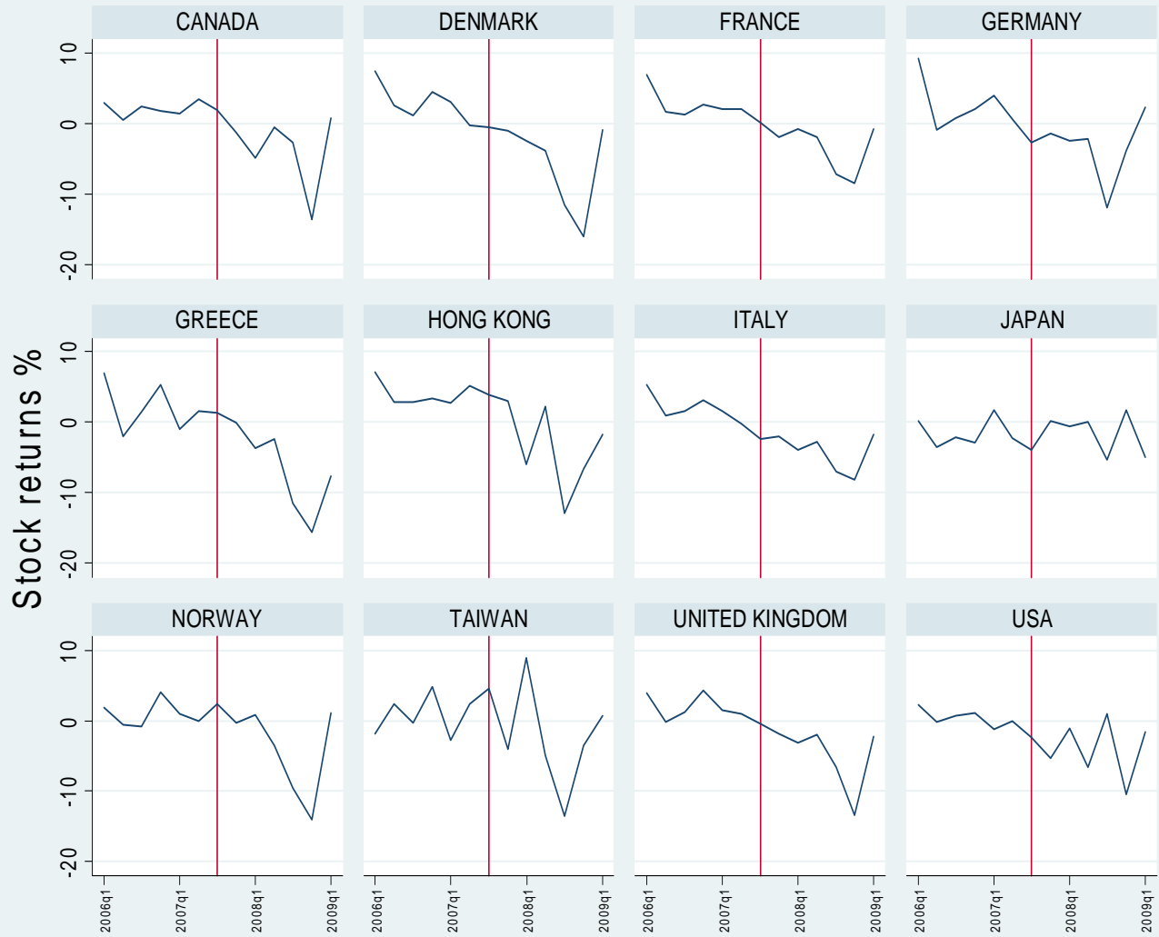
Figure 1 Average quarterly bank stock returns by country, Q1.2006-Q12009